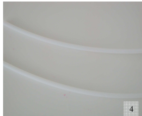
Photos 3 and 4: Assays: Aspect of internal surfaces of the chamber and of external surfaces of the surrogate device after contamination and cleaning by the SL-ENT-APA (SOLUSCOPE SAS) standard cycle (see table I, phases 1 to 4).

Le présent rapport ne doit pas être reproduit, sinon dans son intégralité, sans l'autorisation écrite de Biotech Germande